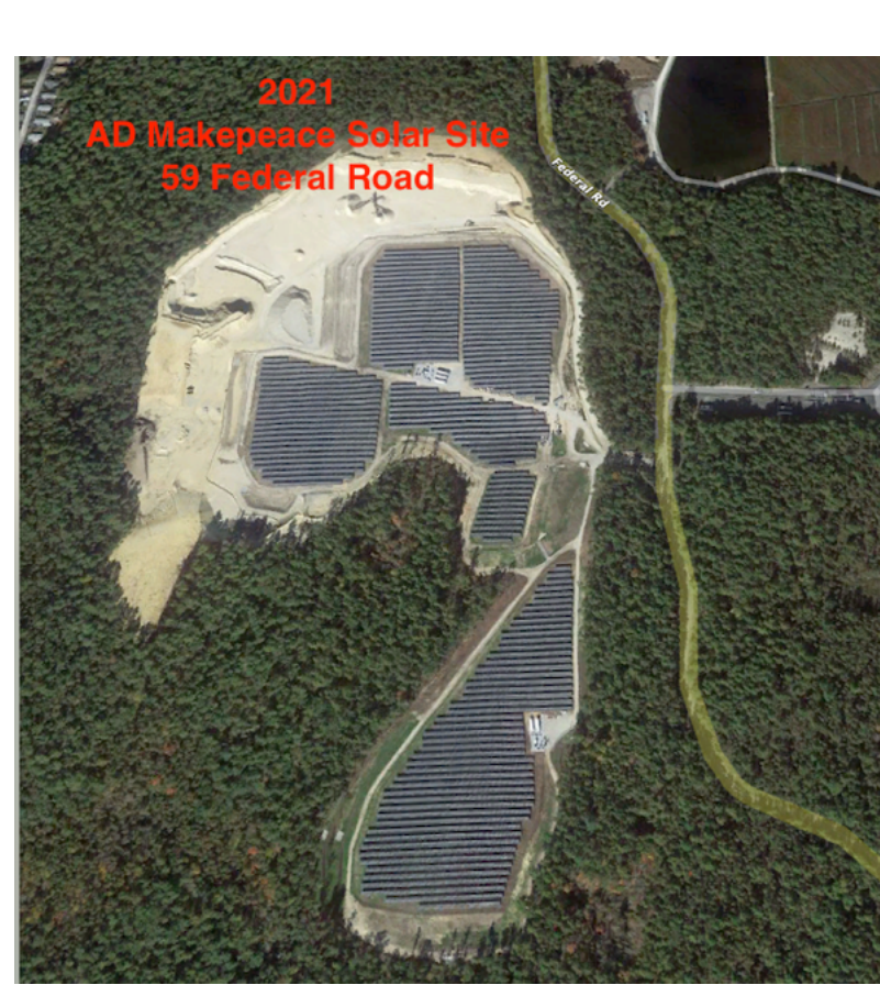
AD Makepeace Solar Site on 59 Federal Road in Carver, MA before and after solar installation

The proposed <u>Cranberry Point Energy Storage</u> would be one of the largest lithium-ion energy storage facilities in the world. It is planned for Carver's Craig Street and Fosdick Road neighborhoods off Main Street 400 feet from the nearest home. Carver Concerned Citizens says the lithium-ion batteries pose a risk of fire and explosion that could release toxic chemicals into the groundwater.