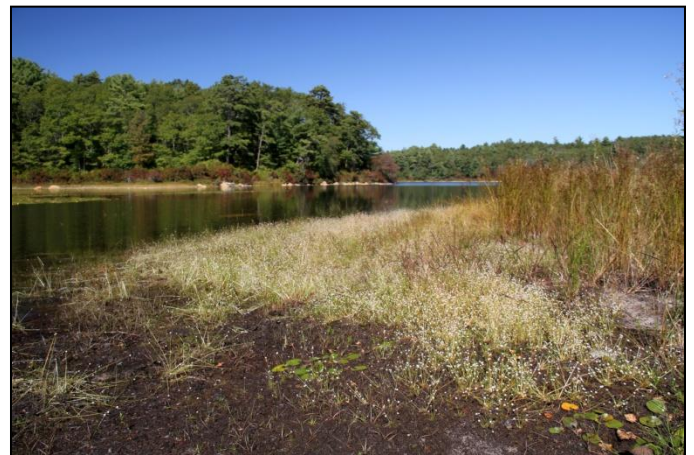
Above: Exemplary coastal plain pond habitat of the Northern Red-bellied Cooter in Plymouth, Mass.

HABITAT IN MASSACHUSETTS: In Massachusetts, the Northern Red-bellied Cooter primarily inhabits freshwater ponds and rivers that have abundant aquatic vegetation and suitable basking sites in the form of logs, rocks, and vegetation mats. Most of the original documented occurrences of Red-bellied Cooters were associated with coastal plain ponds, although they have also been documented in manmade reservoirs and cranberry ponds and introduced to larger lakes and rivers. Red-bellied Cooters nest in exposed sand and gravel, lawns, gardens, and roadsides near ponds and rivers from late May to early July.