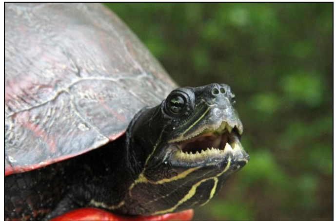
Above: Note the strongly cusped jaws of this adult female Northern Red-bellied Cooter.

In some instances, herbicide use in ponds to decrease pond vegetation and the infiltration of herbicides from adjacent cranberry bogs is believed to have altered the Red-bellied Cooter's food source and exposed it to chemical contamination. These impacts combined with the species' late maturation age and low rate of reproduction (less than one-third of females reproduce yearly) have made it difficult for the Red-bellied Cooter to thrive. Hatchling mortality is very high for this species, with intense predation on the eggs by skunks and raccoons (which increased in population size as residential areas increased) destroying as many as half of the Red-bellied Cooter's existing nests. Bullfrogs, water snakes, wading birds, and predatory fish such as pickerel and bass feed on hatchling turtles.