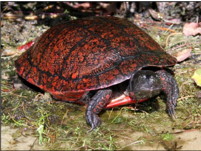
TOP: A comparative photo of a female (left) and male (right) Northern Red-bellied Cooter from Plymouth, Mass. Note the pinkish red plastron color of the female and the larger overall size. MIDDLE: Some adult males (such as the one pictured here) become melanistic with age, losing their juvenile coloration. BOTTOM: Occasionally, older males will develop a marbled, salmon-colored carapace.

RANGE: Massachusetts populations of Northern Red-bellied Cooter comprise an isolated, disjunct population approximately 200 miles from the nearest populations in New Jersey. In Massachusetts, the species is currently confined to ponds and rivers within Plymouth County and eastern Bristol County. Massachusetts populations were formerly described as a distinct subspecies, P. rubriventris bangsi (Plymouth Redbelly Turtle). The primary range of the Northern Red-bellied Cooter extends from the Coastal Plain of New Jersey south to the Outer Banks of North Carolina, inland to West Virginia in the Potomac watershed. Archaeological evidence from Massachusetts midden sites indicates that prior to European settlement, Red-bellied Cooters occurred as far north as Ipswich, Essex County, as well as in the Sudbury River and on Martha’s Vineyard.