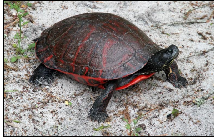
Above: An adult female Northern Red-bellied Cooter from Plymouth, Mass., showing characteristic brownish carapace with red markings.

SIMILAR SPECIES: Eastern Painted Turtles ( Chrysemys picta ) are often mistaken for Red-bellied Cooters. Both species have yellow markings on the head and neck and both may have orange plastrons. Red-bellied Cooters lack a pronounced yellow spot behind the eye, have alternated patterned scutes across the back (unlike the Eastern Painted Turtle), can be five times as massive (as adults), and have a carapace that is normally flattened or slightly depressed on top. The Red-bellied Cooter's plastron is coral red or pink, often with dark markings and circular spots along the perimeter, whereas, the Painted Turtle in Plymouth County usually has a solid orange or yellow plastron with no dark markings and a striped perimeter. The Red-Eared Slider ( Trachemys scripta elegans ) is not native to Massachusetts, but has become common in some ponds in the Plymouth area. Sliders may be told from Red-bellied Cooters by the red stripe behind the eye and darker markings on the plastron. Other turtles from the pet trade occasionally show up, including southern species of Cooters and the Yellow-Bellied Slider ( Trachemys scripta scripta ).