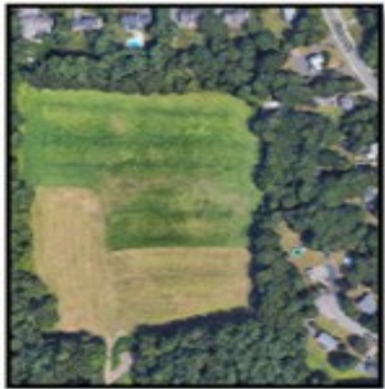
Location of proposed farmland surrounded by residential properties

Most would agree that placement of such large-scale solar panels will obstruct the path of Annual Haunted Hayride and all recreational activities. However, the current County Commissioners believe that Haunted Hayride and walking trails can continue to operate underneath these large-scale solar panels.