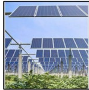
Type of solar panels proposed at the Norfolk County Agricultural High School

Financially speaking , according to the proposed plan shared during public hearings, Norfolk County is expected to lease the 9+ acres of farmland at Norfolk County Agricultural High School for $31,500 per year, for a 20-year period. Since the current annual fee for admitting one ‘out-of-district’ student at The Norfolk County Agricultural High School is $24,000 ( and there is a waiting list of students! ), it would be more beneficial for the Norfolk County to admit two out-of-district students instead of giving up 9+ acres of green farmland for $31,500 annually.